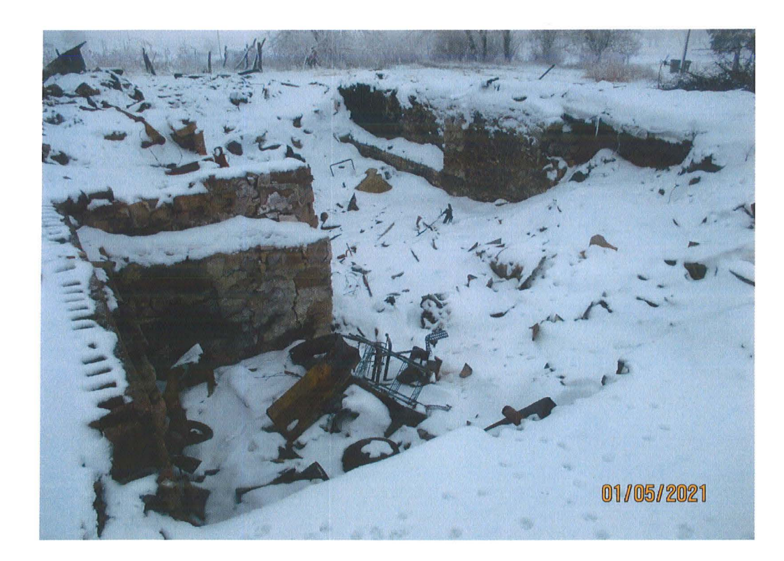
Date: 1/5/21 Time: 10:00 AM Direction: East Exposure #: 1 Comments: Burnt House Demolition Debris.