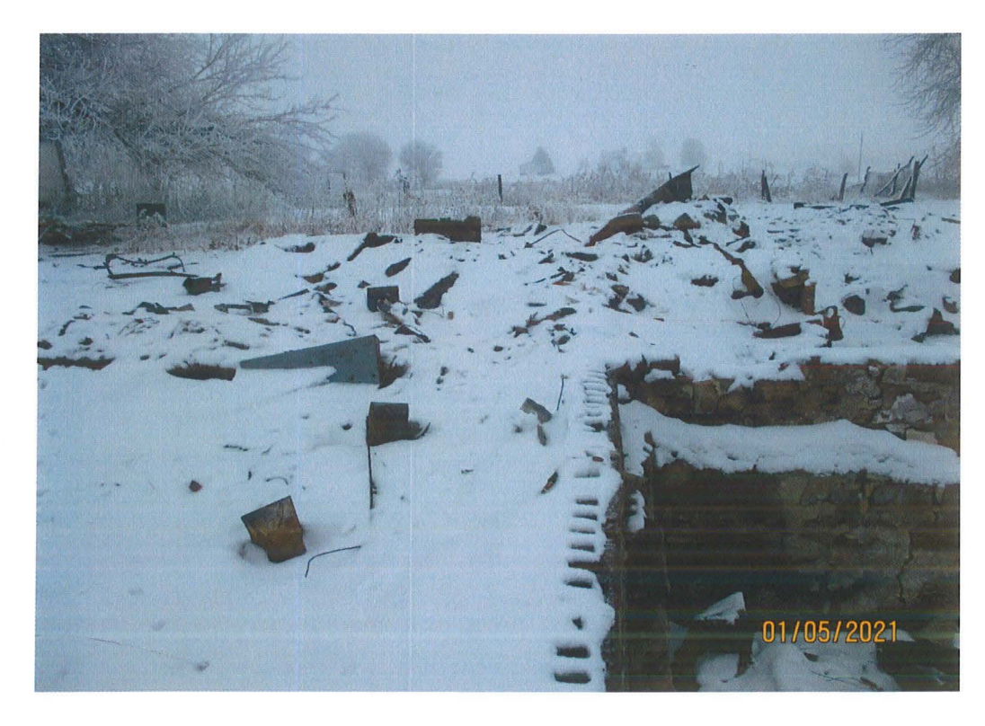
Date: 1/5/21 Time: 10:00 AM Direction: Northeast Exposure #:2 Comments: Burnt Demolition debris.