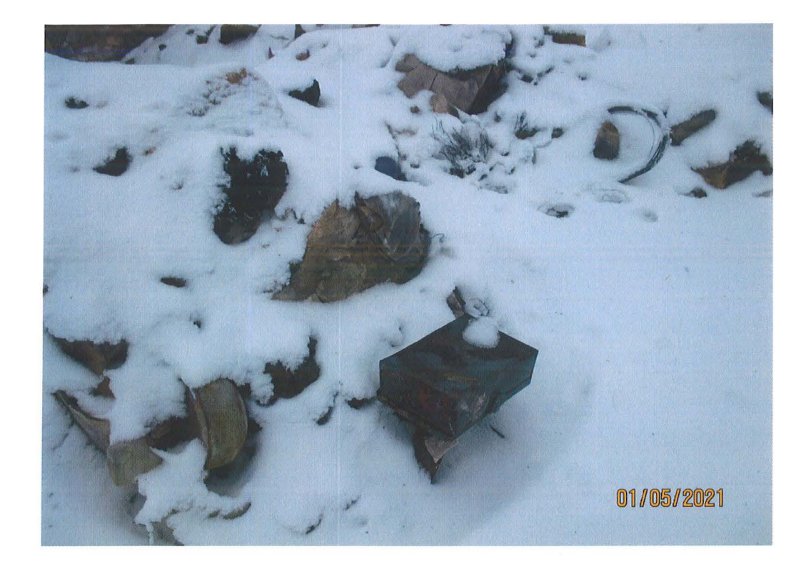
Date: 1/5/21 Time: 10:01 AM Direction: North Exposure #: 5 Comments: Tire wire and charred demolition debris.